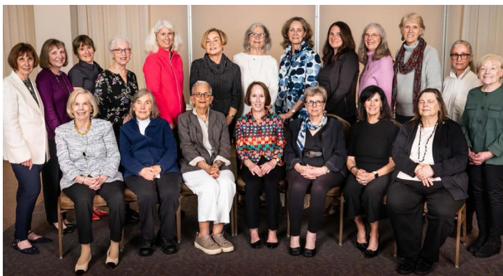
The 2024-2025 Steering Committee was introduced at the May Full Circle (Report on page 6)