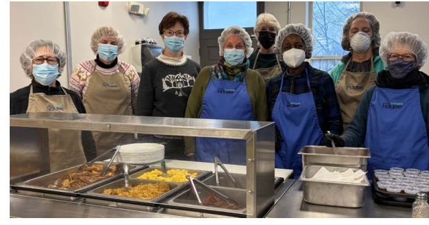
Circle Works subcommittee volunteering at Manna House