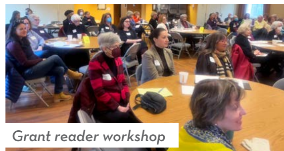
Grant reader workshop